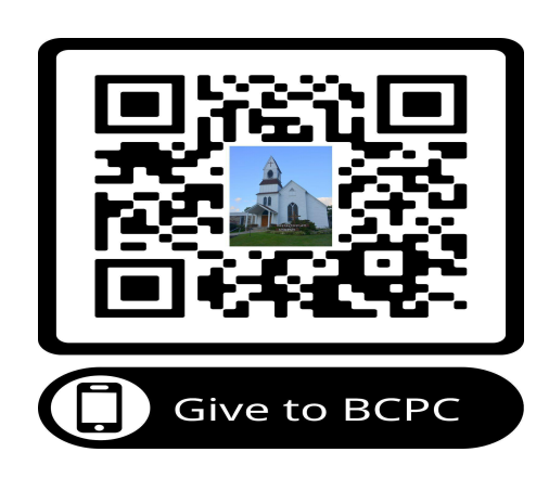
This is a QR Code and can be scanned by your phone's camera. If your phone does not have this capacity, you can download an app. This code is linked to the church's Paypal account.

YTD Financials Unrestricted Giving $100,509 Operating Expenses $95,947 Operating Excess/Deficit $4,562