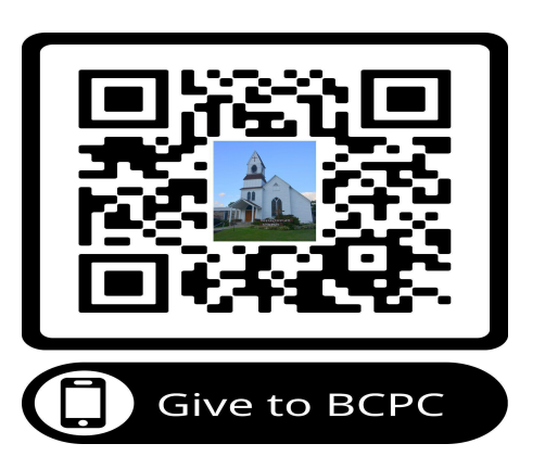
This is a QR Code and can be scanned by your phone's camera. If your phone does not have this capacity, you can download an app. This code is linked to the church's Paypal account.

YTD Financials Unrestricted Giving $96,962 Operating Expenses $89,631 Operating Excess/Deficit $7,332